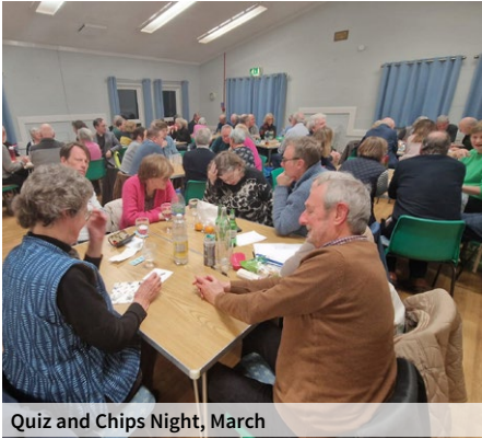
Quiz and Chips Night, March