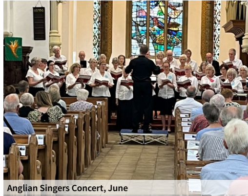
Anglican Singers Concert, June