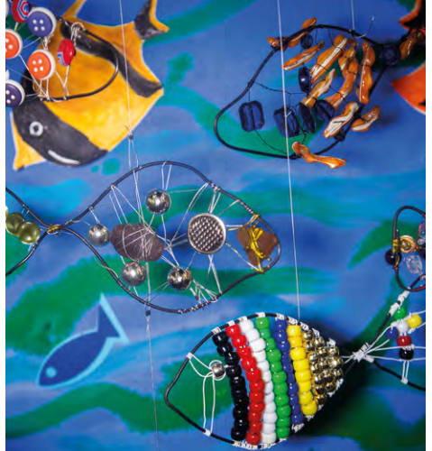
Fantastic Fish Exhibition