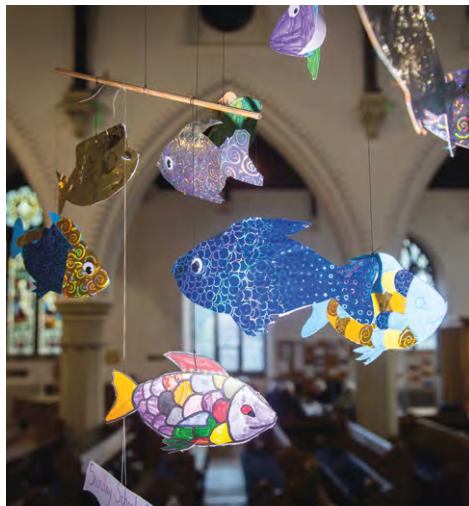
Fantastic Fish Exhibition