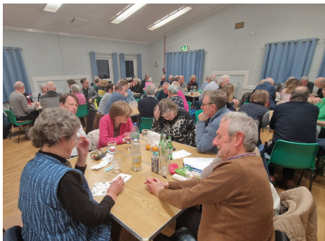
Quiz and Chips Night, March