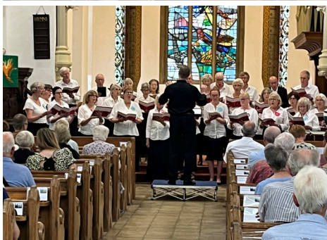
Anglian Singers Concert, June