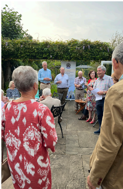
2024 Annual Meeting and Reception